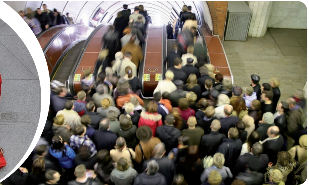
'Group' and 'crowd' levels